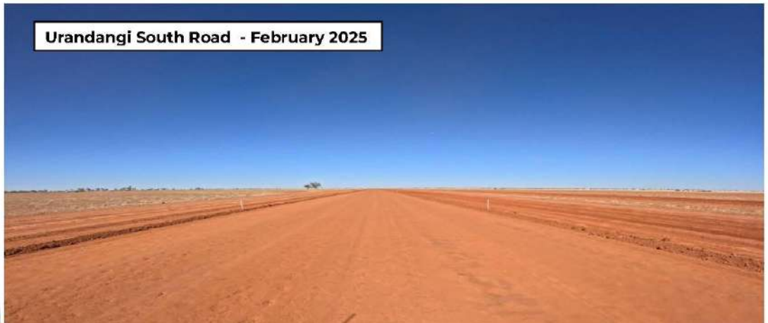
Urandangi South Road - February 2025

We have several projects this year to keep our local contractors busy for the calendar year