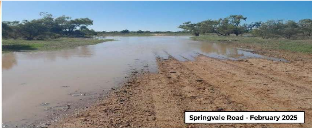
Springvale Road - February 2025